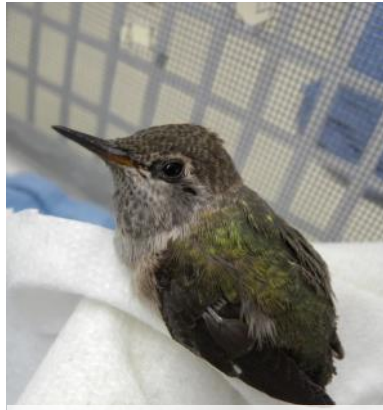
Fledgling Anna's Hummingbird

284 Boyce Rd / PO Box 391 Friday Harbor, WA 98250 (360) 378-5000